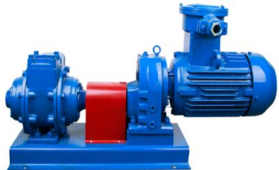
Direct Gear driven