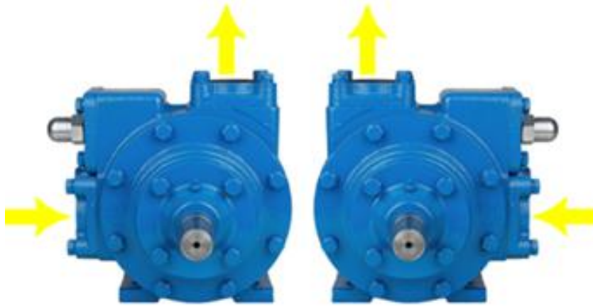
LEFT AND RIGHT INLET